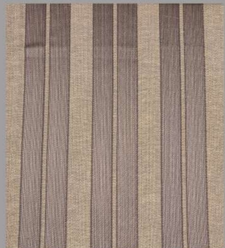
19131 COL 51