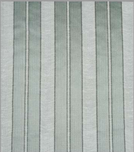
19131 COL 06