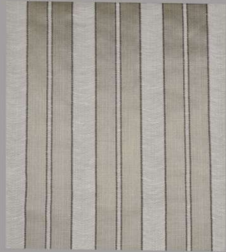
19131 COL 08