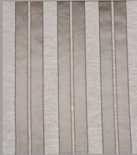
19131 COL 10