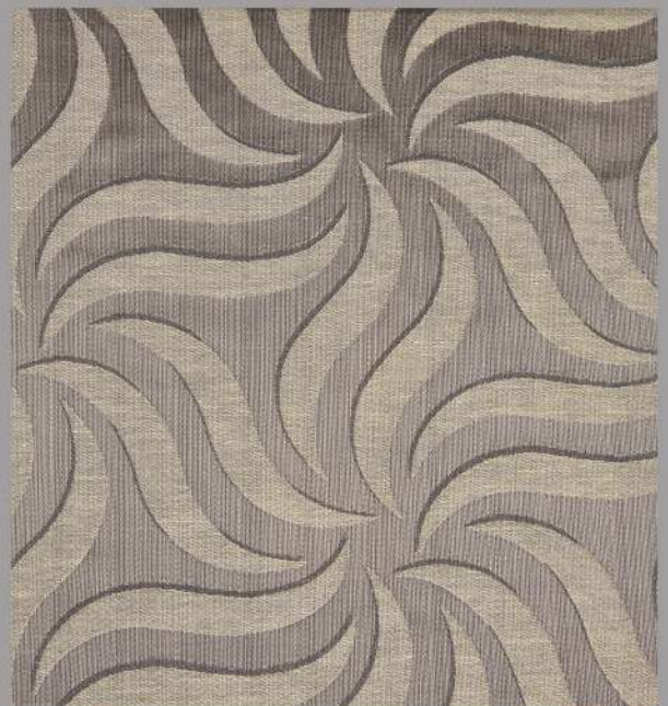
19133 COL 51