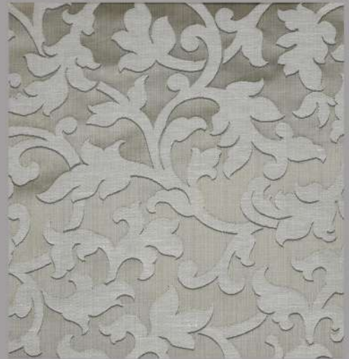
19128 COL 08