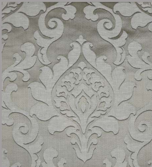
19126 COL 08