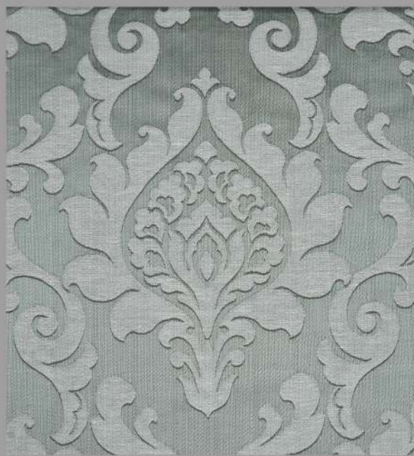
19126 COL 06