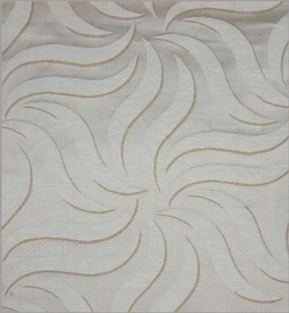
19133 COL 01