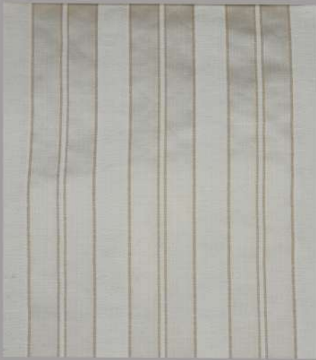
19131 COL 01