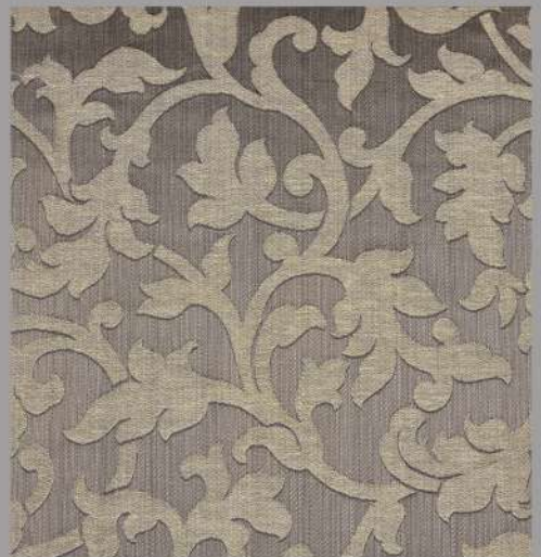
19128 COL 51