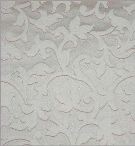
19128 COL 01