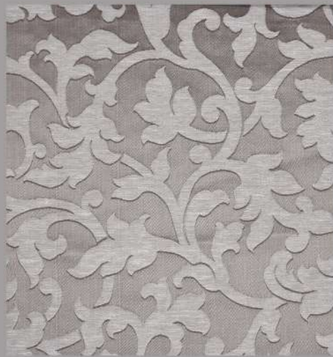
19128 COL 10