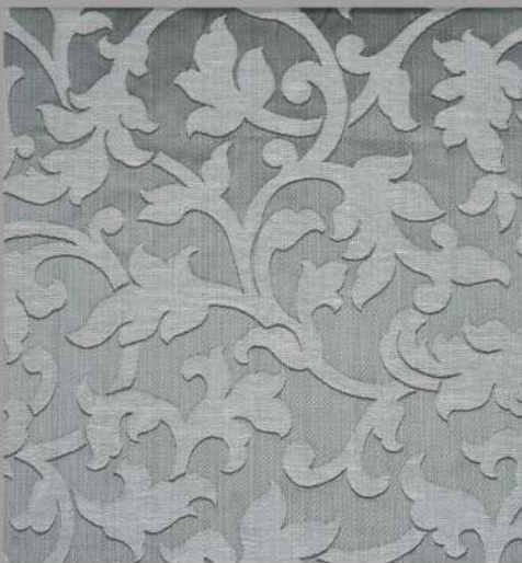
19128 COL 06