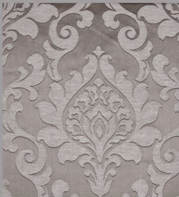
19126 COL 10