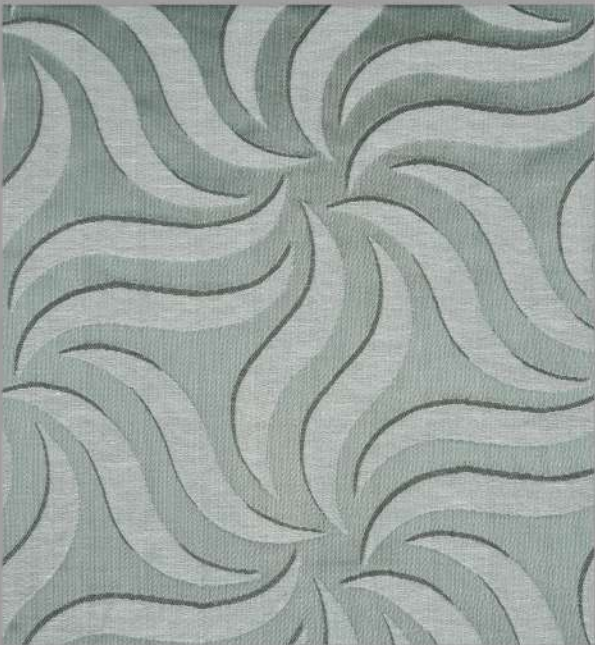
19133 COL 06