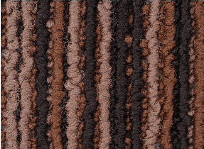
C5.01 - CINNAMON