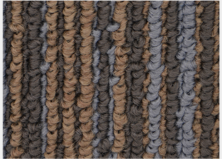
C5.04 - CORAL