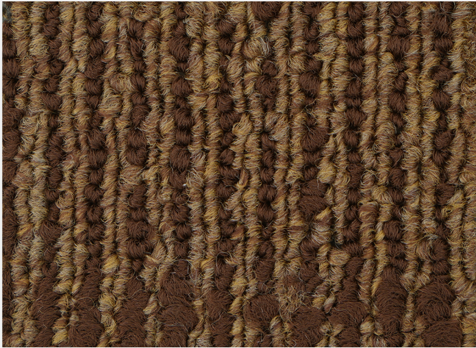
U3 - 03 BROWN