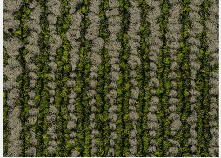
U3 - 02 CALISTA GREEN